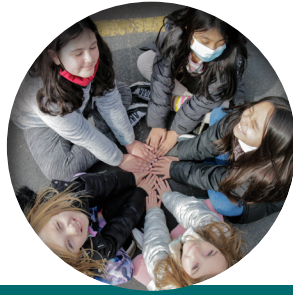
Children, Youth & Families