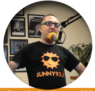
Intellectual & Developmental Disabilities